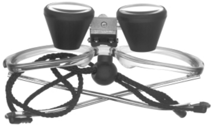
75% of Actual Size